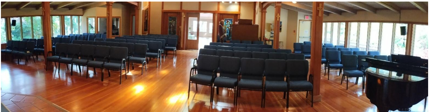
New Chairs and Refinished Sanctuary Floor – August 2025

In August 2025 the Parish replaced the chairs in the nave. The fabric on the old red chairs had degraded due to UV exposure from the uncovered clear glass windows and re-covering was more costly than replacing the chairs. The new chairs have commercial grade fabric with UV resistance. We took the opportunity to apply a finish coat to the nave floor and thus extend its life. The work of clearing the sanctuary so the floors could be refinished, moving chairs in and out (twice) and attaching the book racks was carried out by a small band of volunteers, who gave of their time and energy without complaint.