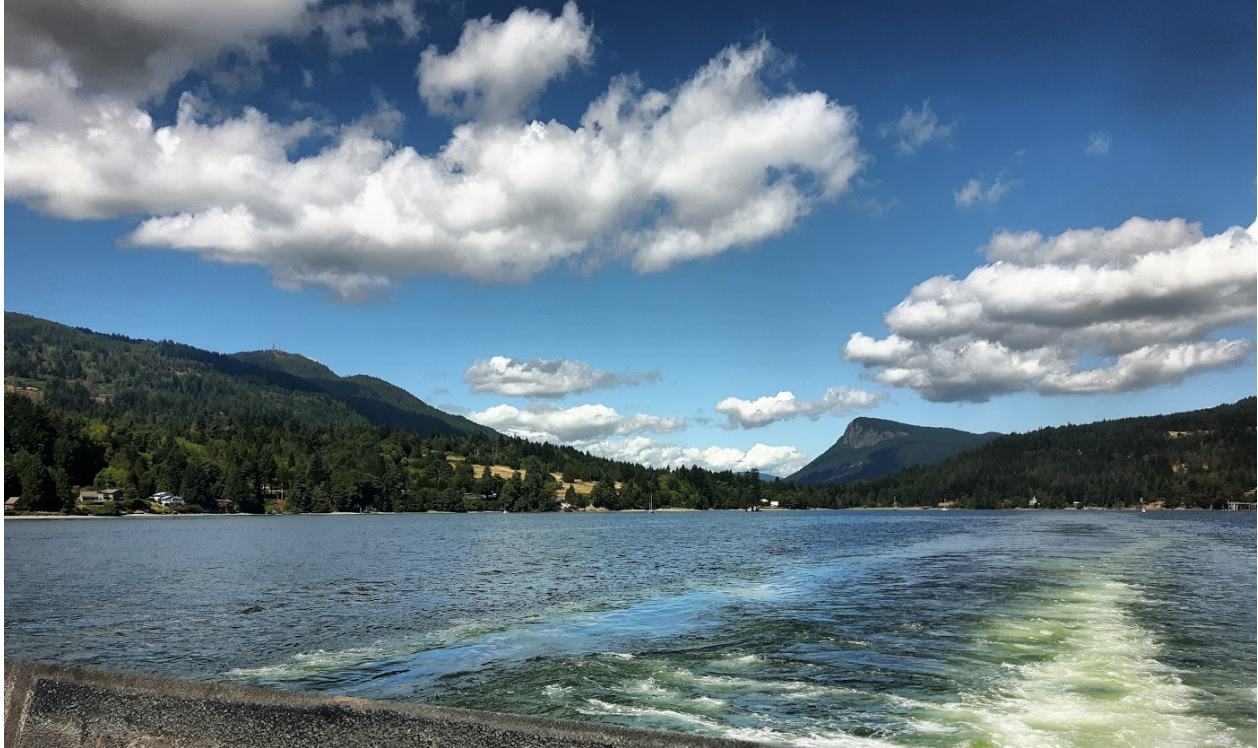
Leaving Fulford Harbour on SSI bound for Swartz Bay

Health services are of high quality on Salt Spring. The life expectancy from birth on the island in 2015 was 84.43 years – slightly higher than either Vancouver or Victoria. The Lady Minto Hospital provides primary hospital services including emergency care, acute care, and long-term care. BC Ambulance provides transfers to larger hospitals on Vancouver Island and the mainland as required by helicopter and ambulance. Again, all is not wonderful. Finding a general practitioner can be difficult, mental health services are in short supply, and emergency dental services do not exist.